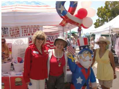
Uncle Sam loves our patriotic booth

We still need volunteers for the Chili Cook-off on Sept. 5 and 6. Call Cindy Linke at 310-457-4510