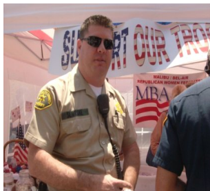
Many officers and veterans stopped by to say thanks.