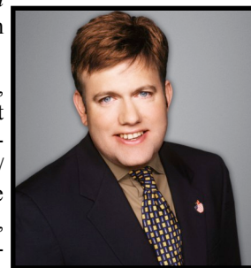
Frank Luntz, Pollster

Dr. Luntz will be our luncheon speaker on Friday, February 27. We will gather for a buffet lunch at 12:00 pm at Pepperdine’s Drescher Campus Auditorium. At 12:30 pm, active members will vote on our Club’s name change to Malibu/Bel-Air RWF. At 12:45 pm, Dr. Luntz will be introduced. He has conducted more than 2,000 surveys, focus groups, ad tests, and dial sessions in over two dozen countries over the past decade and has become the go-to consultant when CEOs need communication and language guidance: from General Motors to Federal Express, Disney, AT&T, Microsoft, and McDonald’s, to name a few.